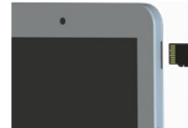
Figure 4. Inserting and Retrieving a Micro SD Card

Using a small pin or paperclip, push the Micro SD card in (towards the right of the unit if mounting in portrait). The slot will release the SD Card and a spring will push it out.